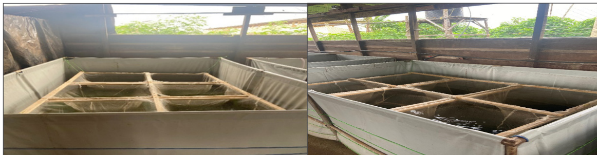
Figure 1. Farming structures

The study was conducted from 1 st March to 31 st July 2025 at the Application and Research Farm (FAR-UDS) of the University of Dschang, located in the Menoua Department, West Region of Cameroon.