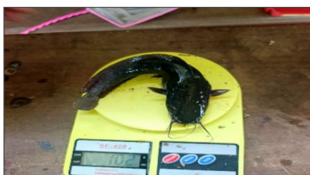
Figure 3. Weight measurement

This allows the weight gain of fish over a given period to be assessed. It was calculated using the following formula: \text{Weight gain (g)} = \text{Final weight (g)} - \text{Initial weight (g)}